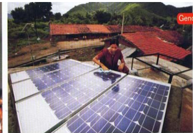
Each village house has a solar panel on its roof, generating light and power